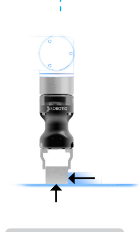
PRECISELY DETECT CONTACTS